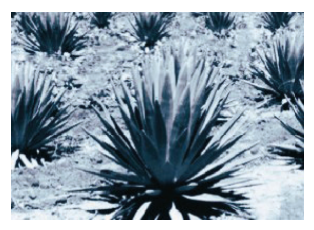
Figure 1: Sisal plantation

Extracted from the leaves of the agave sisalana, a plant native to Mexico, sisal fiber was introduced to Brazil around 1900, especially in the northeast region. Currently, the largest producers are the states of Bahia, Paraíba and `` Rio Grande do Norte ``. Sisal fiber is widely used in the manufacture of ropes, twine and carpets. In addition, current applications as reinforcement in composite materials (Silva et al., 2009). Figure 1 illustrates the aforementioned plant.