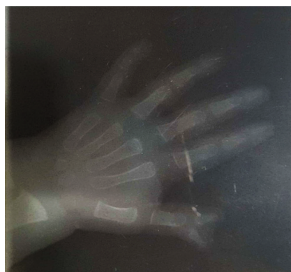
Figure 2B. Polydactyly

thrombocytopenia and osteochondroma of the knee (chief complaint). It is important to take into account that most patients tend to have a variety of manifestations, some tend to develop book manifestation but others tend to have isolated manifestations which can potentially misguide the diagnosis of FA due to not seeing the presentation as a syndrome but as separate pathologies. This patient did not debut with a malignant neoplasm, but seeing the whole picture he had most manifestations regarding the syndrome. The case demonstrates the importance of early diagnosis and early appropriate medical management to improve outcomes for individuals with FA.