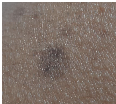
Figure 2A. Café-au-lait spots

malformations, signs described can have a subtle or severe manifestation, in the majority of patients diagnosis will be made after the onset of pancytopenia (5).