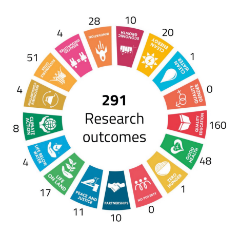
Figure 4 : Mapping of ISEC Lisboa's 2022 research outcomes, in accordance with the SDGs.

Recognizing the escalating challenges confronting both society in general and businesses in particular, ISEC Lisboa, as a knowledge-producing HEI, aspires to position itself as a vital force in generating applied and collaborative knowledge while actively disseminating such knowledge. In this vein, and with the overarching goal of aligning research efforts with contributions to the SDGs, the research outcomes of 2022 has been strategically harmonized with the SDGs (Figure 4).