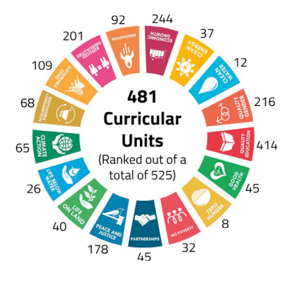
Figure 3: Distribution of the SDGs in the Curricular Unit Sheets classified in the various degree-awarding study cycles (Higher Technical Courses, Bachelor's Degrees and Master's Degrees) in 2022.

ISEC Lisboa actively is advancing sustainability-focused teaching and learning, aiming not only to equip students with highlevel professional skills but also to nurture responsible citizens who positively impact the environment, the society, and the economy. To achieve this overarching goal, the institution has implemented a range of initiatives designed to disseminate and promote sustainability. Furthermore, there is a dedicated focus on raising awareness and understanding of the SDGs, fostering the skills of educators through various seminars and training sessions within the academic community. Additionally, a concerted effort has been made to seamlessly integrate sustainability content into curricular units across diverse study cycles. comprehensive approach involves classifying and cataloging the contribution of each curricular unit to the SDGs through detailed Curricular Unit Sheets. In the year 2022, the outcomes of this initiative materialized in the cataloging of curricular units within the 24 degree-awarding study cycles currently in operation. A total of 481 curricular units, representing 91.62% of the 525 possible curricular units, were successfully classified (Figure 3).