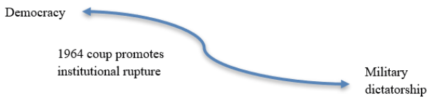
Scheme 1: Contextualization of concepts

consequences. At various times they seek to elucidate the dangers of living in an authoritarian society, whose citizens are deprived of their political and social powers. Through the teaching of this content, the aim is to foster an appreciation for democracy in students, as well as the defense of Human Rights. It is about encouraging them to think about all the practices adopted by agents of the Brazilian State, such as: political repression, suppression of the rights to freedom and institutionalization of torture.