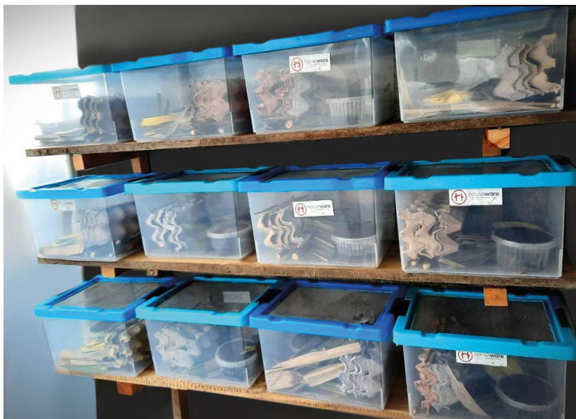
Figure 2. Experimental units