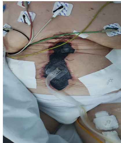
Figure 4: Peritoneostomy with vacuum dressing for second look