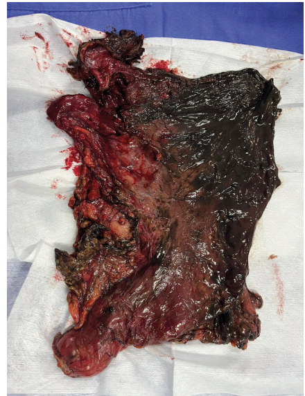
Figure 3: Total gastrectomy product