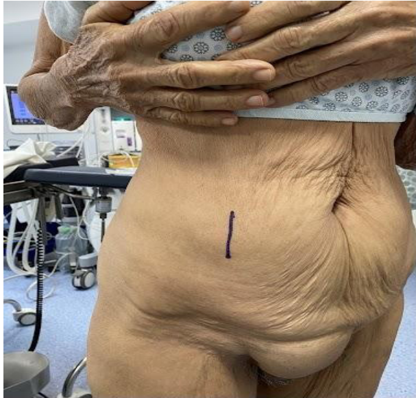
Picture 1 - Preoperative: lateral border of the rectus abdominis muscle.