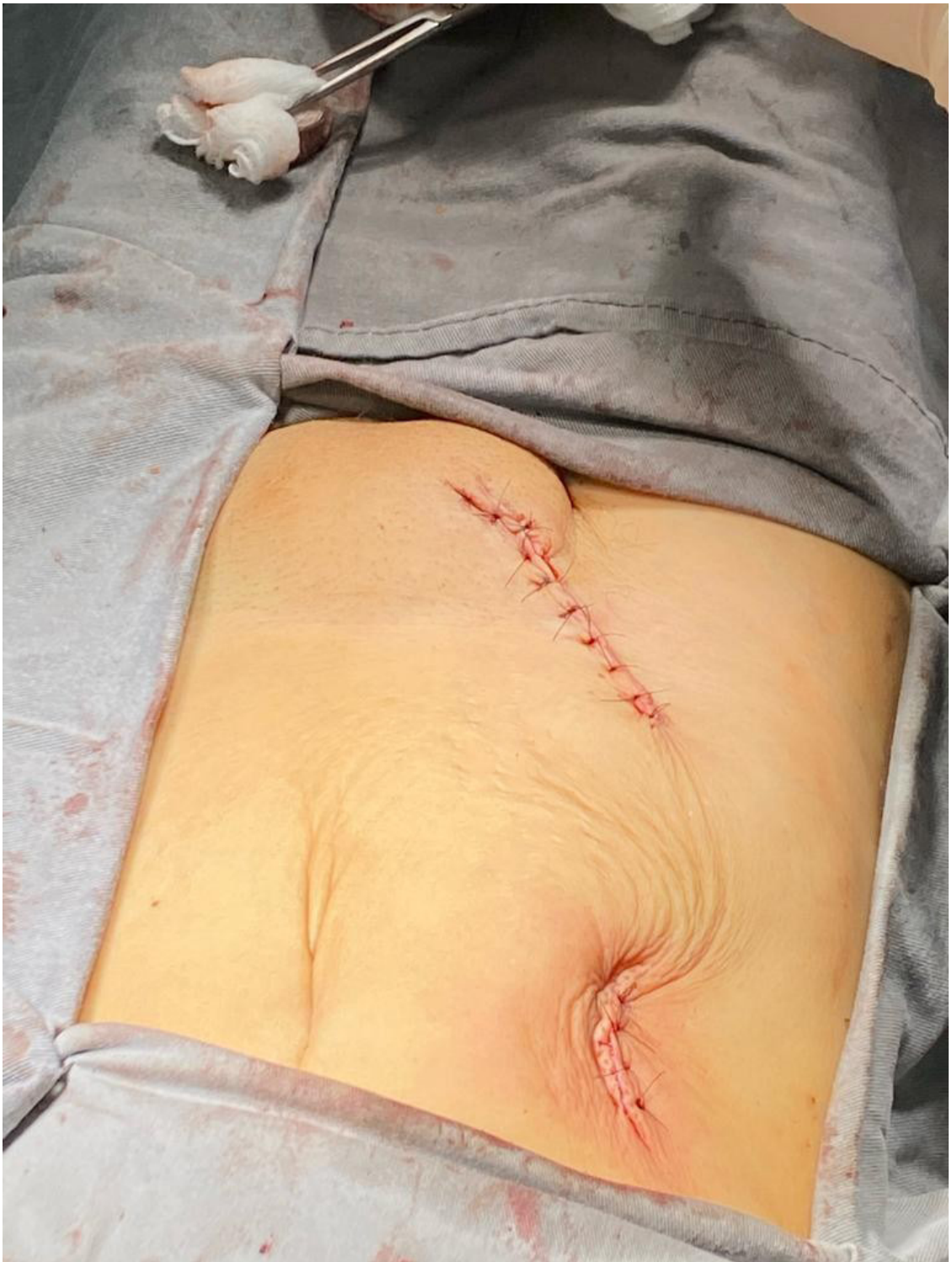
Picture 4 - Immediate postoperative period: oblique scar in the right inguinal region above and scar in the right paramedian region below.