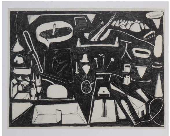
Figure 2. Untitled, 2003, graphite on paper, 120 x 160 cm.

character, with the (unconventional) freedom of the metaphorical, subjective and dynamic connection between objective realities.