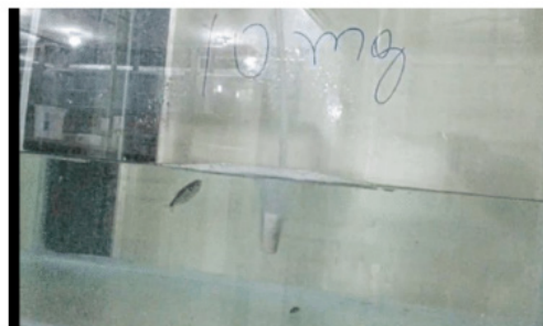
Figure 3. Lambari showing restlessness and erratic swimming in the 10mg/L treatment

In the first test, alteration of the fish was observed soon after the addition of Triclosan in the water. The fish showed agitation, breathing difficulties, muscle spasms, hemorrhages throughout the body, mainly in the gills, erratic swimming and whirling that culminated in the death of all fish in less than 30 minutes (Figure 3). The three fish from the control treatment without alcohol and the three from the control group with alcohol remained alive without showing any clinical signs throughout the experiment.