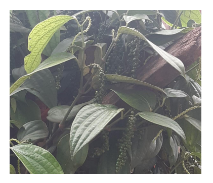
Figure 1. Leaves and spikes/peppers with green seeds of black pepper ( Piper nigrum ) collected in Tangará da Serra/MT.

Serra/MT (coordinates 14°36'23" S 57°29'04" W, alt: 380 m) (Figure 1). The collections were carried out in the afternoon, between 14:30 and 18:30.