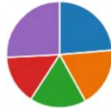
Figure 1 - Age group.