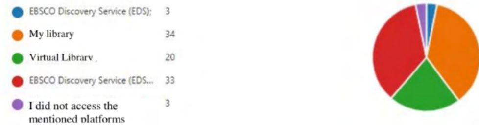
Figure 5 - Access to digital platforms.

5. Have you accessed the digital book platforms mentioned below?