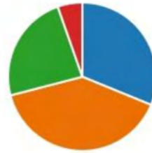
Figure 9 - Content quality.