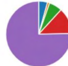
Figure 3 - Region of the country where you reside.