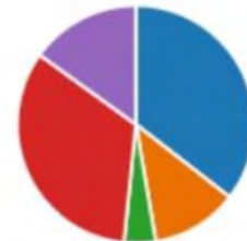
Figure 2 - Level of education.