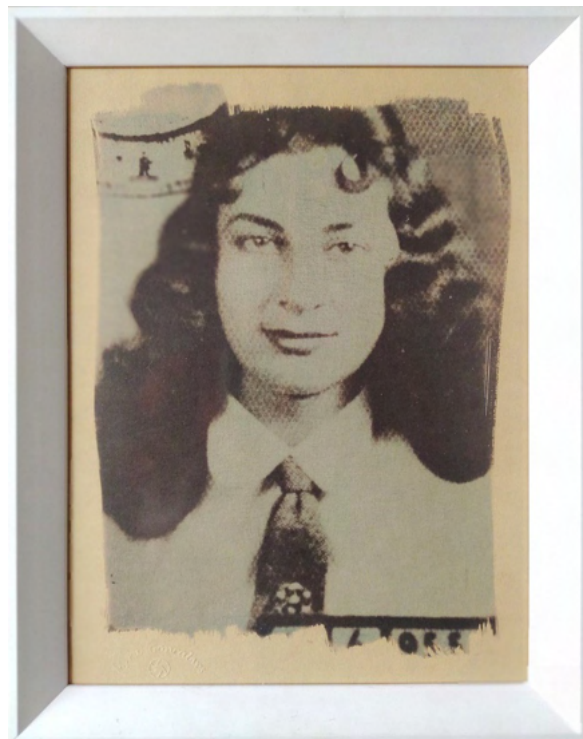
Figure 6: Myra Gonçalves, Untitled, 2017. Undercut cyanotype with sodium carbonate, toned with tannic acid, 30 x 20 cm.