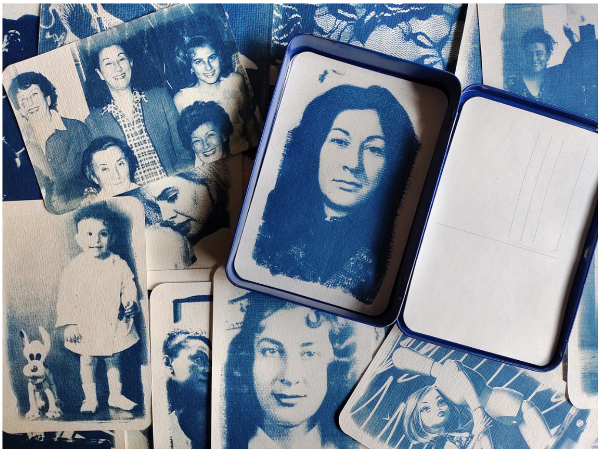
Figure 9: Myra Gonçalves, Postcard box , 2019. Cyanotype on Hahnemühle paper, 30 postcards, 10.5 x 14.8 cm each. Source: author.