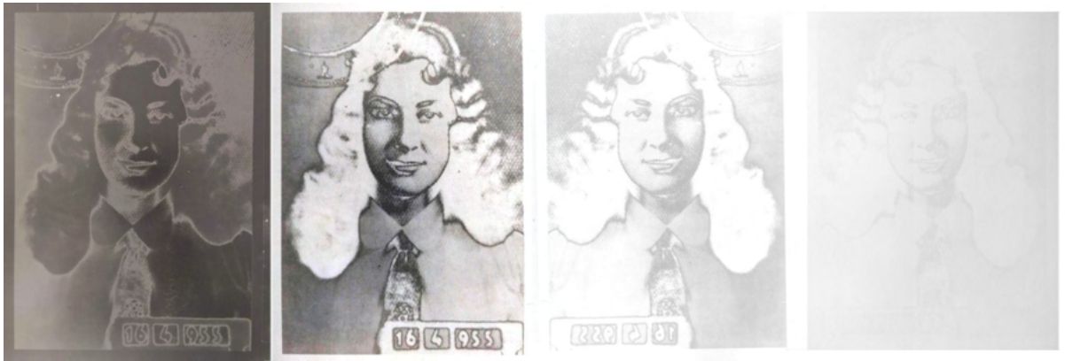
Figure 8: Myra Gonçalves, Untitled , 2018. Solarization on silver paper, 4 photographs, 24 x 18 cm each.