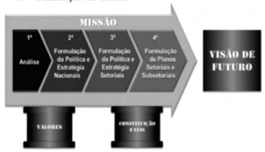
Figure 2 - Structure of the planning and formulation process of Defense documents.