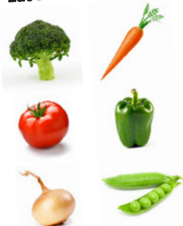
Broccoli, Pepper, Tomato, Carrot, Onion, Peas