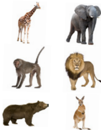
Bear, Elephant, Monkey, Lion, Kangaroo, Giraffe